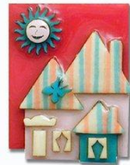
A sample of a house pin

The cost per pin is $16. We will have the winter pins available for sale on a table as you enter the Empty Bowl Soup Supper on November 19.